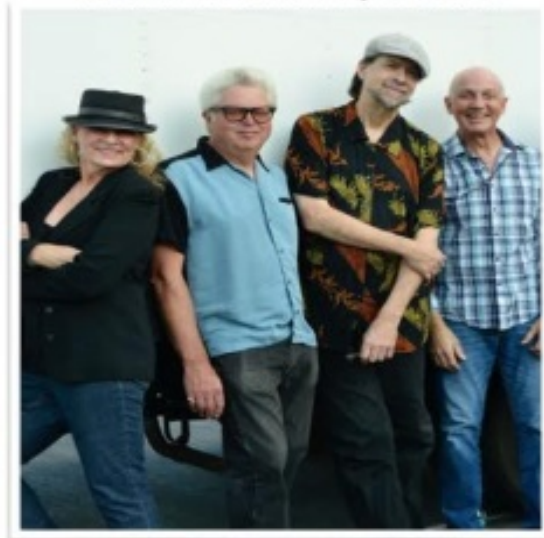
The Cartell Quartet

Admission: Adults-$5; Kids under 10-Free.